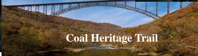
Coal Heritage Trail